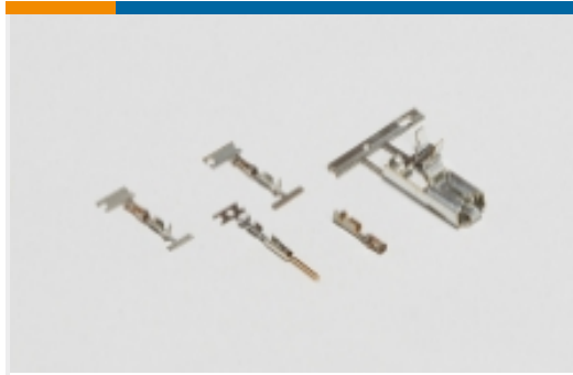
Wire-to-Board Connector Contacts(3)